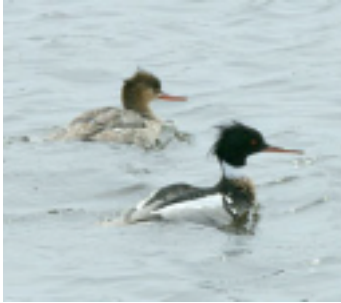
Red-breasted Mergansers M&F