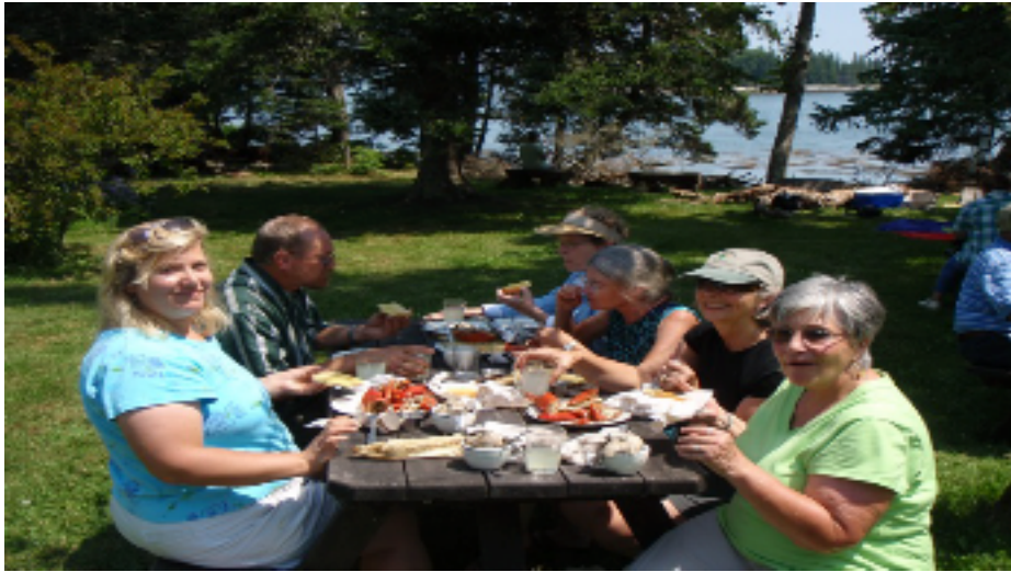
All ate well