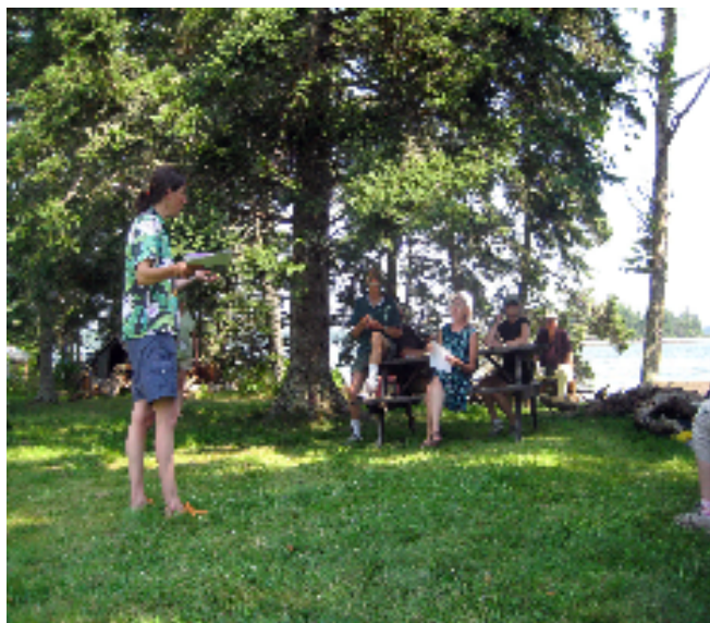
Prexy Speaks !

We also supported the Seabird Education program in local schools and provided 5 camp scholarships to deserving mid-coast residents.