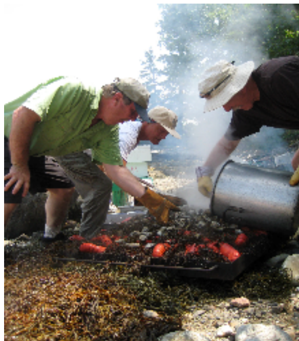
Time to eat !