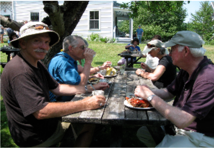
Stil more eating !