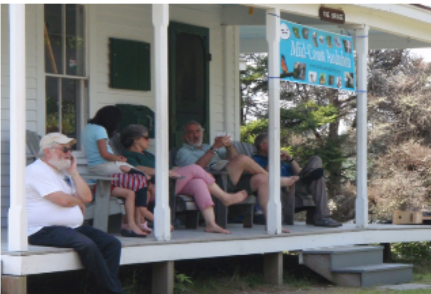
Resting after lobster !